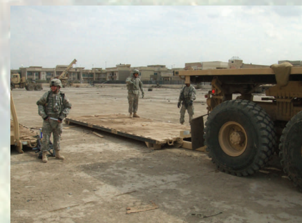
PFC Banches gives a block of instruction to Soldiers from the 82 nd Airborne Division on stacking flat racks, while PFC Augustyn watches.