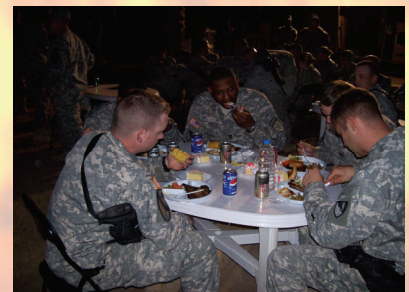
Captains sharing a meal together at the March Sapper Call!